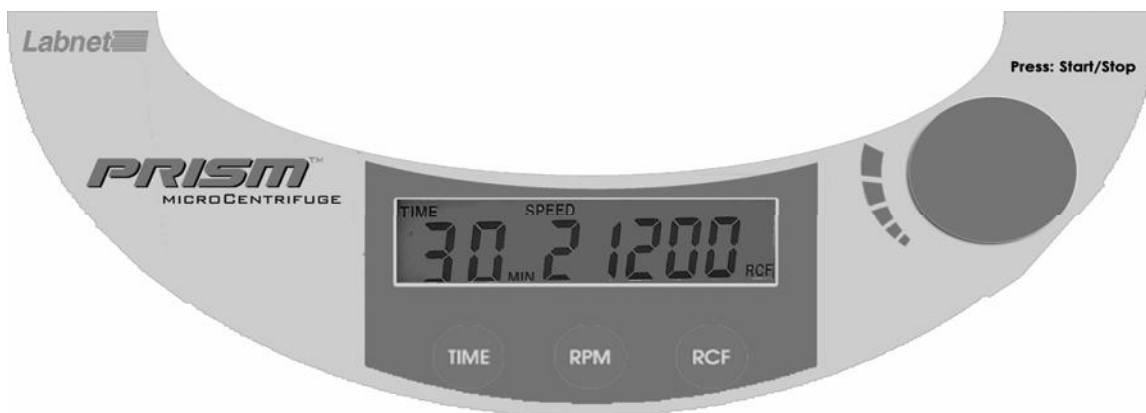
Figure 2. Prism Microcentrifuge control panel layout

Operating time can be selected from 0.5 min to 99 min by pressing the TIME button and adjusting with the control knob. The time can be set in 0.5 minute increments from 0 to 10 minutes and in 1 minute increments from 10 to 99 minutes. After 99 minutes, the display shows "--" which indicates continuous run. In this mode, the centrifuge will run until manually stopped. To start a run, press the control knob. When the preselected time expires, the centrifuge will stop automatically. To stop the centrifuge prior to the expiration of set time, press the control knob. The centrifuge may be operated for a short run by pressing and holding the control knob. The centrifuge will continue to run as long as the control knob is depressed and the time, in seconds will count up on the time display.