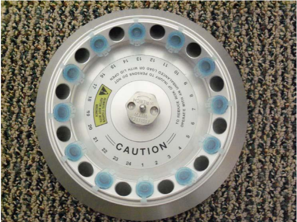
Figure 1. Loading the rotor to achieve balance

To replace rotor, first make sure the motor shaft and rotor mounting hole are clean. Place the rotor on the motor shaft. Reinstall the rotor securing screw on the motor shaft by turning it clockwise. Hold the rotor with one hand and tighten the rotor securing screw, using the rotor wrench.