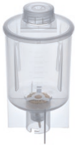
DIS-300-S-M.10 Dissolver tube Volume: up to 300 ml Application: Crushing and dissolution of tablets and dragées. This tube is equipped with a dissolver blade and opens up new application fields. It was especially designed for dissolving samples in different solvents. Ident. No. 0020016318