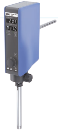
T 25 easy clean digital High-performance disperser Ident. No. 0025002560