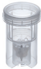
BMT-50-G Tube for grinding with glass balls (10x) Volume: 15 – 50 ml Application: Dry milling of dry and brittle samples (e.g. kaolin, gypsum, coloured pigments, tablets), cell maceration, processing of materials mixed with fluids. Ident. No. 0003699800